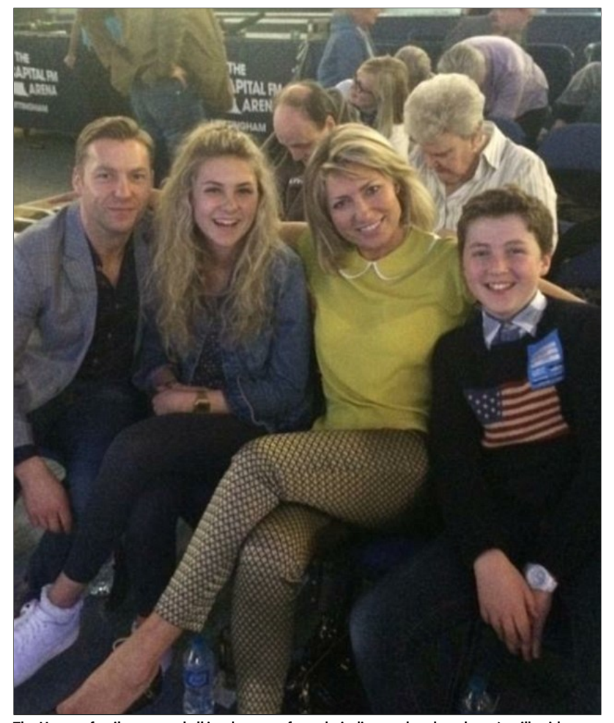
The Henson family removed all intolerances from their diets and replaced cow's milk with soya milk. Twelve weeks later they started reintroducing some trigger foods back into their diets with successful results

'Since starting my new eating regime, I've gone from having migraines on a weekly basis to having just three in total - they pretty much disappeared after six weeks. I was amazed.